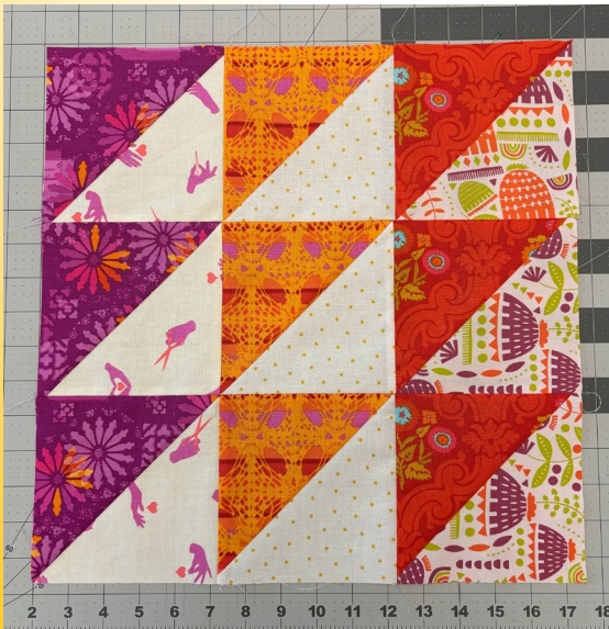
November 2024 – HST 9 patch